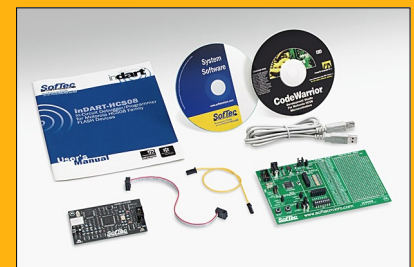
An inDART-HCS08 Design Kit Package